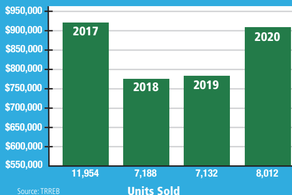
Average Home Prices - March in the Greater Toronto Area