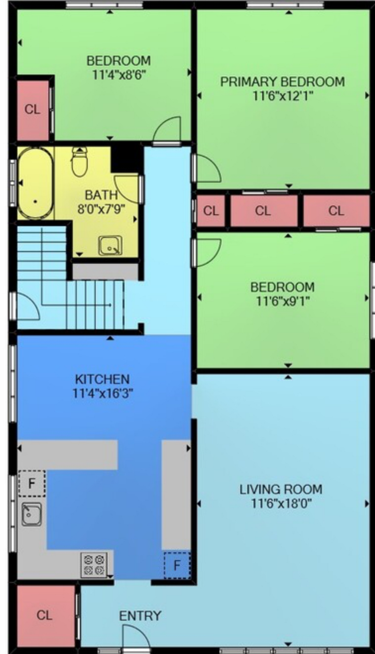
Sizes and dimensions are approximate. Actual may vary. This plan is for illustration purposes only and should be used as such by any perspective purchaser.